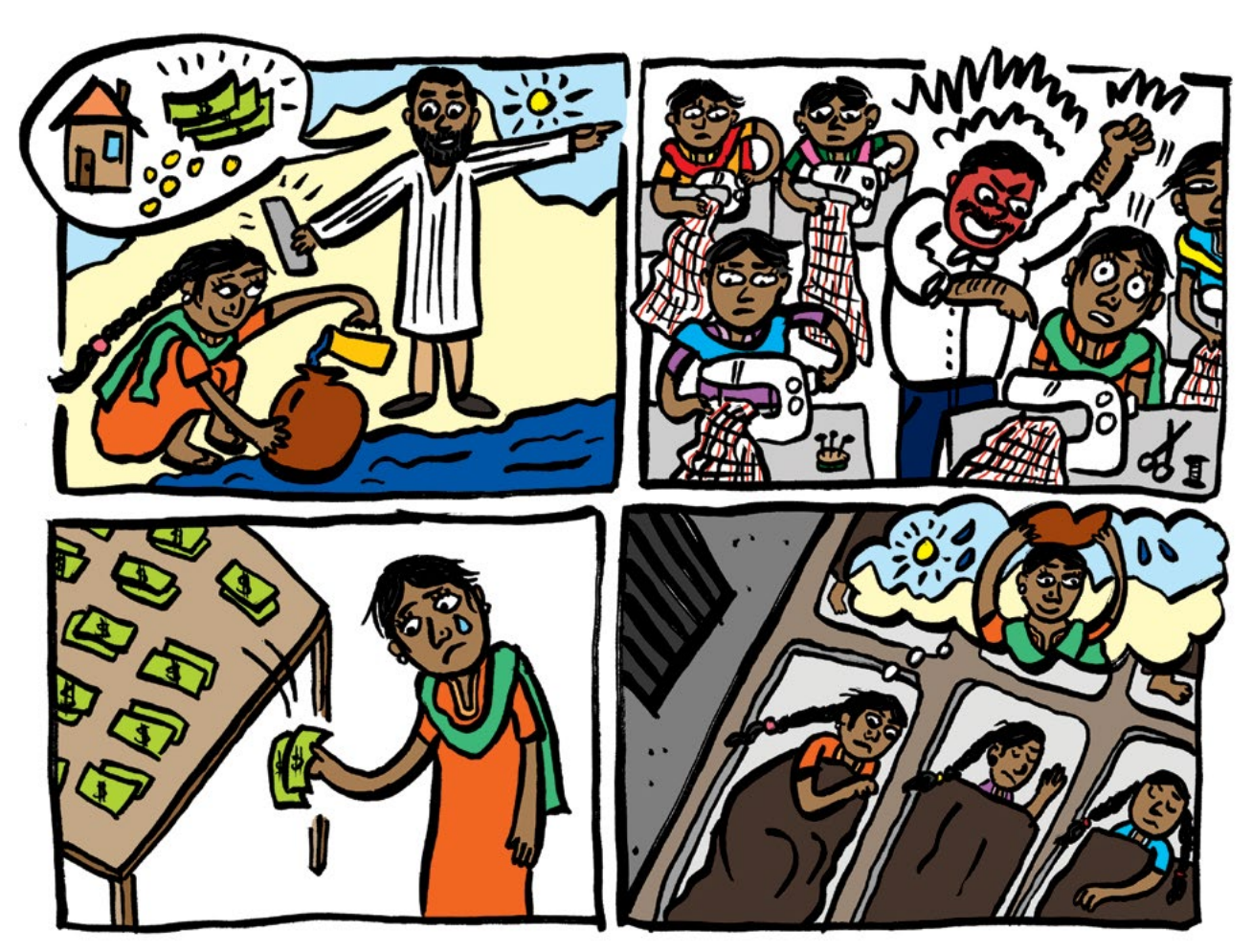
Working conditions for female migrants in Indian garment factories

This report is structured according to the strategic principles of our organisation. We will briefly introduce each principle and describe some concrete examples of our work in this field. Our aim with this report is to highlight our work and the successes we have achieved, based on concrete examples.